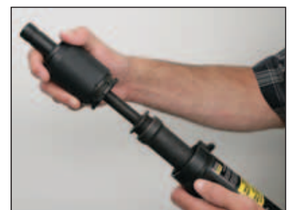
The patent-pending quick-disconnect baseplate makes it easy to convert the PTP-27ALMAGR from a magazine to a single shot tool