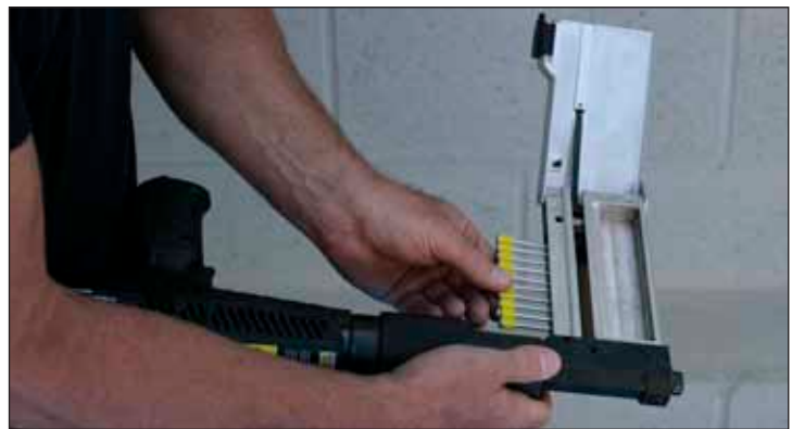
Collated pins for fully automatic fastening and quick loading