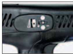
Adjustable power increases versatility