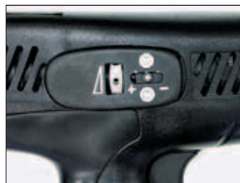
Adjustable power increases versatility