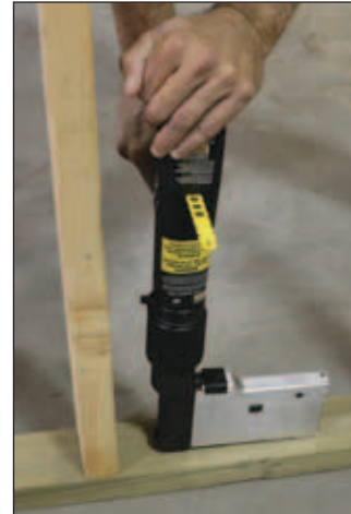
New PTP-27ALMAGR with Rotating Magazine