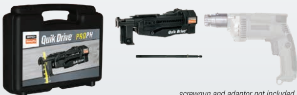
screwgun and adaptor not included

For more information on screwdriver motors and RPM recommendations per application, please see page 180.