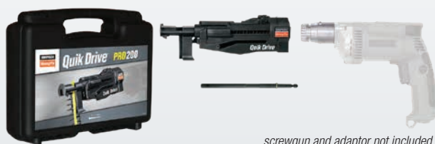
screwgun and adaptor not included

For more information on screwdriver motors and RPM recommendations per application, please see page 180.