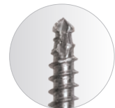
Hardwood drill point virtually eliminates splitting and the need for predrilling