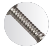
Ribbed shank provides greater holding power